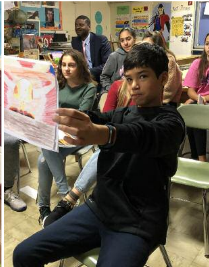
Left page, clockwise from top: Silvermine Elementary School's 20th mural; Students at Nathan Hale zooming with their Russian peers; Students painting the mural; This page: Norwalk Housing Authority youth holding their 'Breathe with Me' painting.