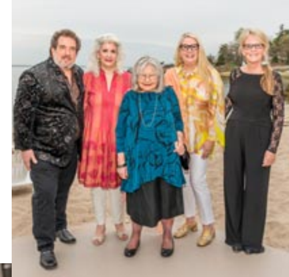
Above: All five honorees gather for their photo on the beach in celebration of their mutual commitment to Silvermine