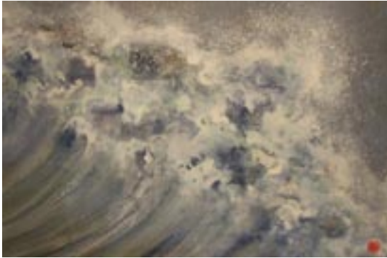
Rosamond Berg Bassett